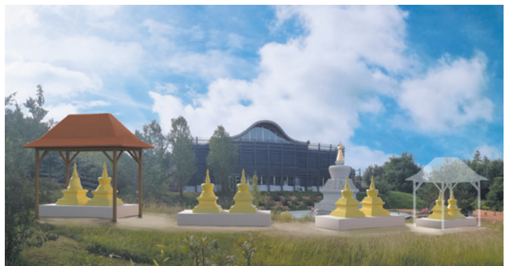
■ A Glimpse of the Eight Stupas Project

We thank you for your generosity and we look forward to welcoming you soon at Dhagpo Kagyu Ling.