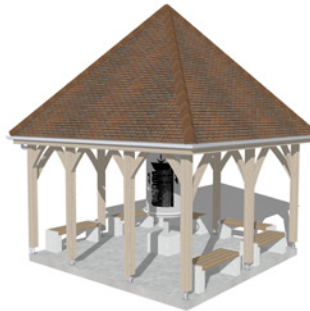
■ The Prayer Wheel

We are currently calculating the cost to realize the eight stupas, the prayer wheel, and the great circumambulation path.