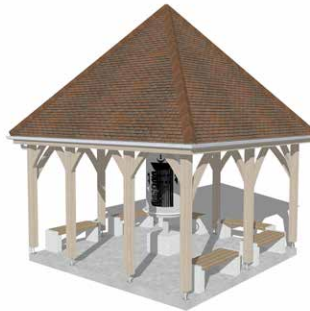
■ The Prayers Wheels

As of today (July 10, 2018), we are currently calculating the cost to realize the eight stupas, the prayer wheel, and the great circumambulation path.