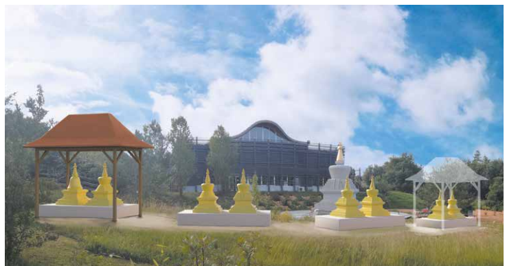
■ A Glimpse of the Eight Stupa Project

We thank you for your generosity and we look forward to welcoming you soon at Dhagpo Kagyu Ling.